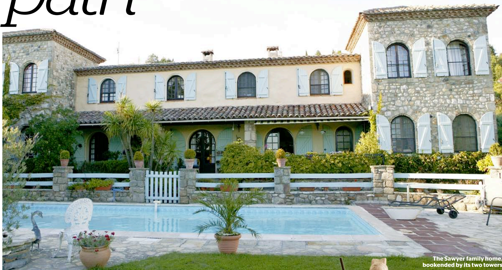
The Sawyer family home, bookended by its two towers

'I've always been fascinated by these warriors, ever since