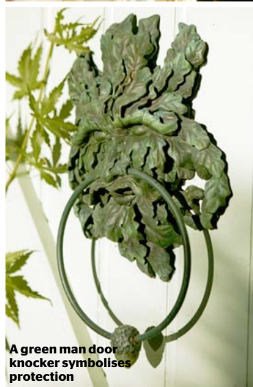
A green man door knocker symbolises protection