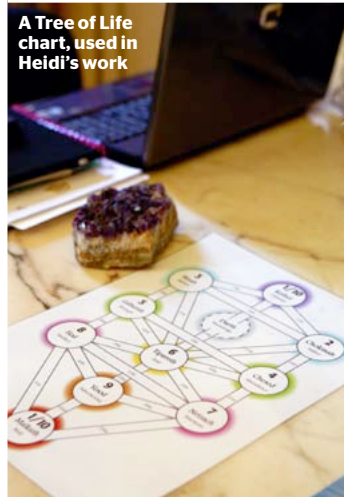
A Tree of Life chart, used in Heidi's work

'In the short time we've been running retreats here, they've been instantly booked up,' says Heidi. 'Each is for about 10 women. They're different every time but are mainly about psychic development, the mind-body connection, and a method I've devised called Life Codes. It uses a combination of numerology, Kabbalah and the Tree of Life archetypes tarot cards to learn about personality, life path and spiritual development. It's highly popular with women who are ready to open up to