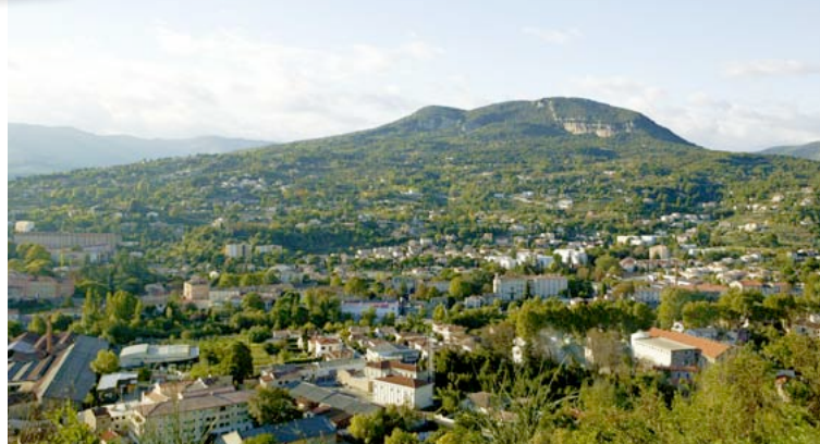
Overlooking the green hills of Lodève