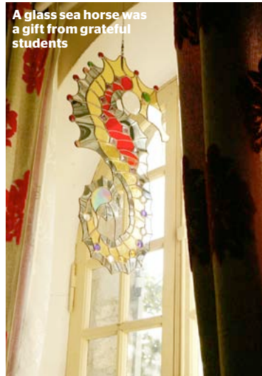
A glass sea horse was a gift from grateful students