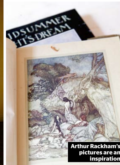
Arthur Rackham's pictures are an inspiration