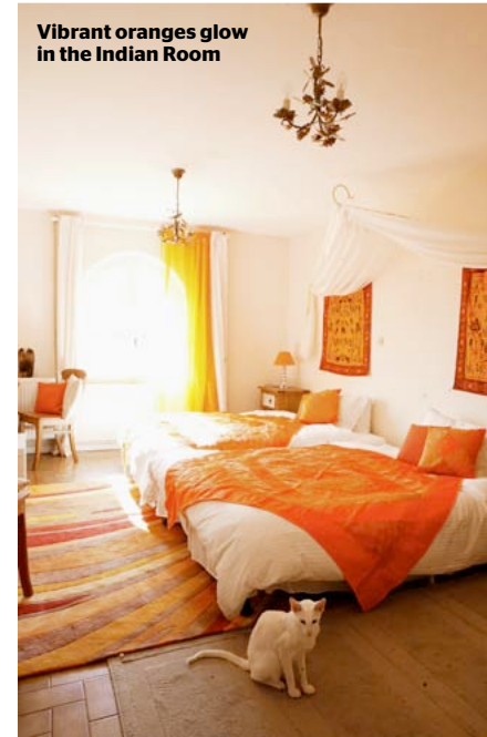
Vibrant oranges glow in the Indian Room

'As soon as we decided we could create a retreat centre here, we knew we wanted it