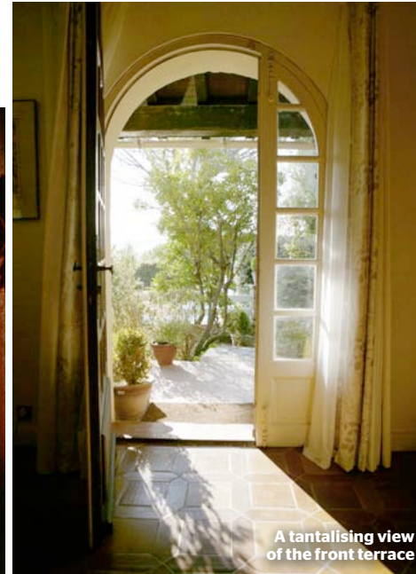
A tantalising view of the front terrace