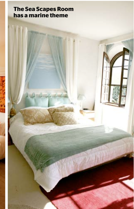
The Sea Scapes Room has a marine theme

to be luxurious and relaxing, as well as a spiritual experience.'