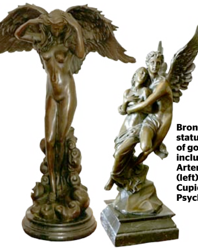
Bronze statues of gods including Artemis (left) and Cupid and Psyche

I was young and saw a picture of the lost Terracotta Army, which was found in the 1970s. Collecting bronze statues of Greek and Roman mythological characters has also been a passion of mine for years.'