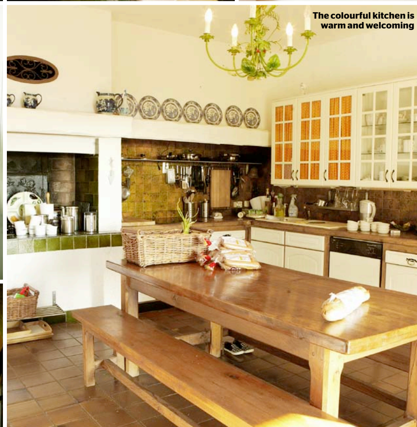
The colourful kitchen is warm and welcoming

for Psychic Circle, her web-based psychic development school.